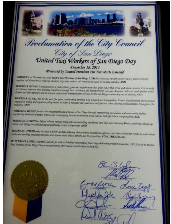
Proclamation signed by the City Council and Mayor proclaiming December 18 th United Taxi Workers Day in San Diego.