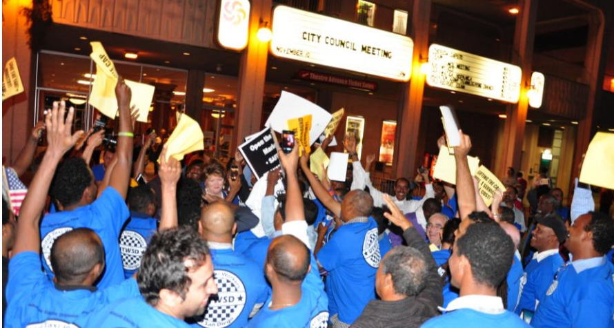
UTWSD Drivers celebrate after the cap was lifted on Nov. 10 th , 2014 at Golden Hall.